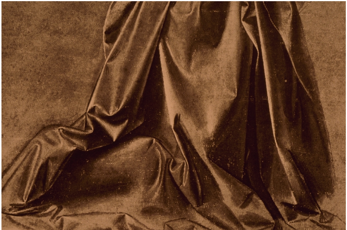
Leonardo da Vinci, “Study of Drapery,” 1473, Louvre, Paris,

Look at the wrinkles on the cloth below. This cloth was drawn by Leonardo da Vinci. Notice the shadows and light areas created by the folds and wrinkles.