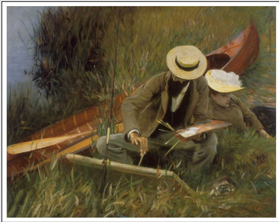
Sargent, "Paul Helleu," 1889

Overlapping is used to show distance in this painting. Who is closer, the man or the lady? Who is farther away?