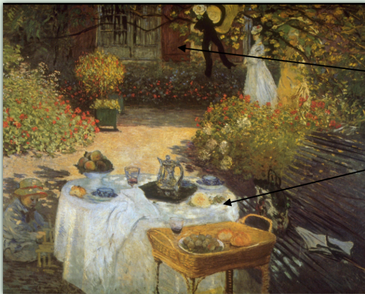
Claude Monet, The Lunch , 1873

The house is much higher in the painting than the table . Do you think the table is closer to us than the house?