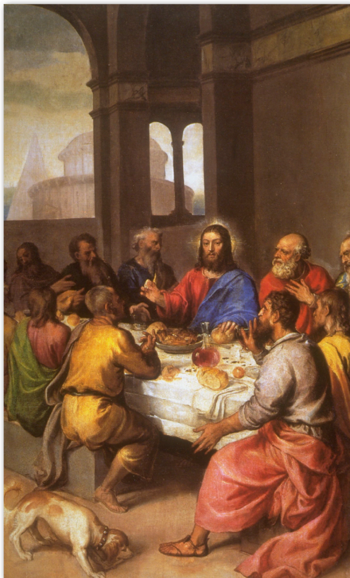
Titian, The Last Supper , circa 1544

Prior to the conversion of the Roman emperor Constantine to Christianity in 313, Christian art was largely hidden, or it was confined to symbols. But after the conversion of Constantine, art depicting Christ began to be displayed openly. The infant Jesus with his mother, Mary, and the death of Jesus on the cross are both popular subjects in paintings because of their significance to Christians . These two themes have been portrayed numerous times as pivotal illustrations of the Christian faith.